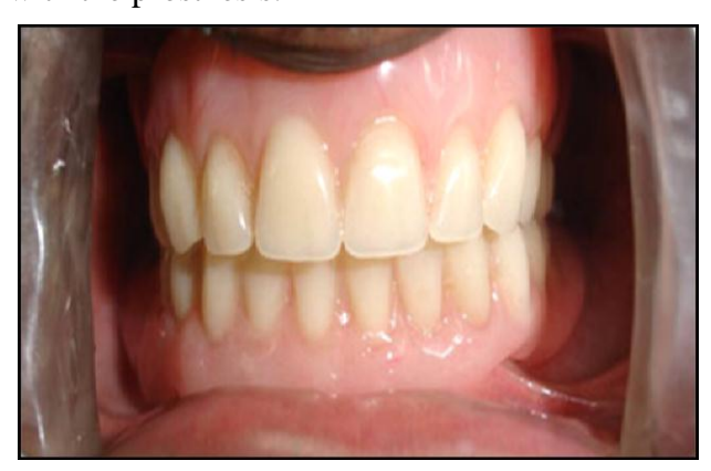
Fig 9: Postoperative view

Post and coping along with male attachments was fabricated. Meanwhile a complete denture was fabricated in the conventional manner. The attachments that are placed have to be parallel to each other to avoid unwanted leverage forces. So, they were placed parallel to each other using a surveyor. For maxillary teeth, copings were made with post. For mandibular mentioned previously teeth as precision attachments are placed on teeth (Fig No. 6). For mandibular arch stainless steel housing with elastic caps has to be incorporated in the denture so to perform this an opening was made at areas of attachments in the mandibular denture (Fig No.7,8). Copings with elastic caps are placed on the attachments present on the teeth. Self-cure acrylic material was used to incorporate the copings in the denture. The final prosthesis was shown in the (Fig No.9). Recall check-up was done, and patient was satisfied with the prosthesis.