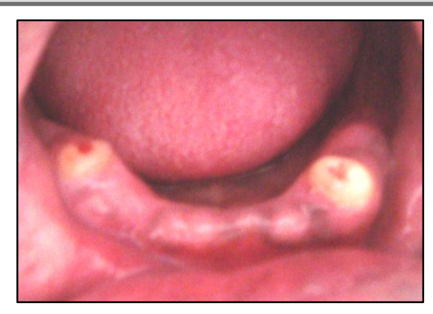
Fig 5: Reduced teeth in mandible