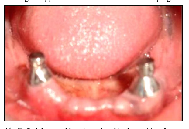
Fig 7: Stainless steel housings placed in the position. Lower teeth restored with casted copings along with attachments