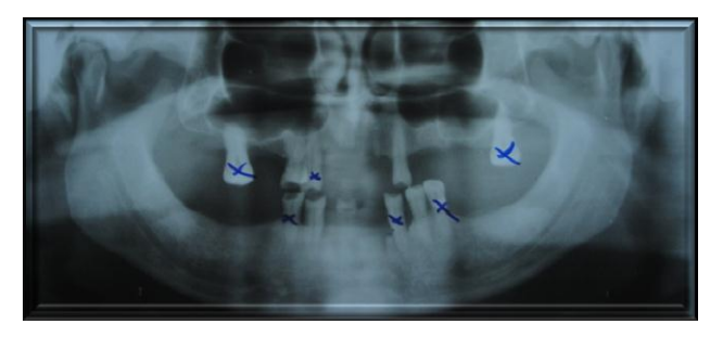
Fig 1: OPG of the Patient

arches along with post space in indirect technique using polyvinyl silicone impression material. Cast was poured using die stone.