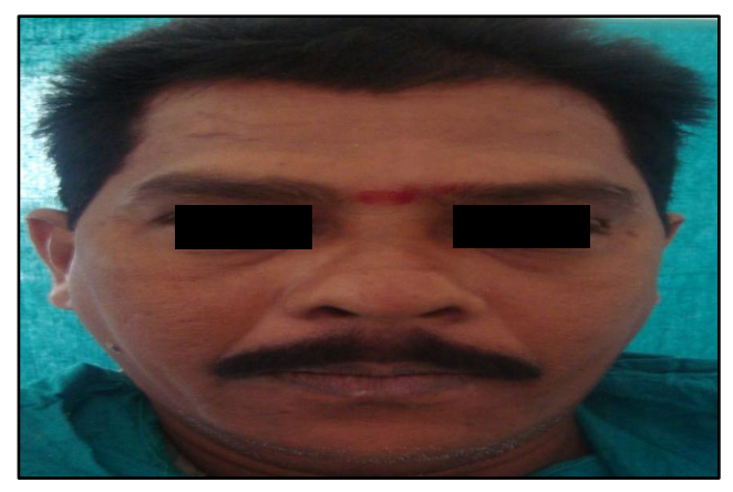
Fig 2: Pre-operative Photograph of patient